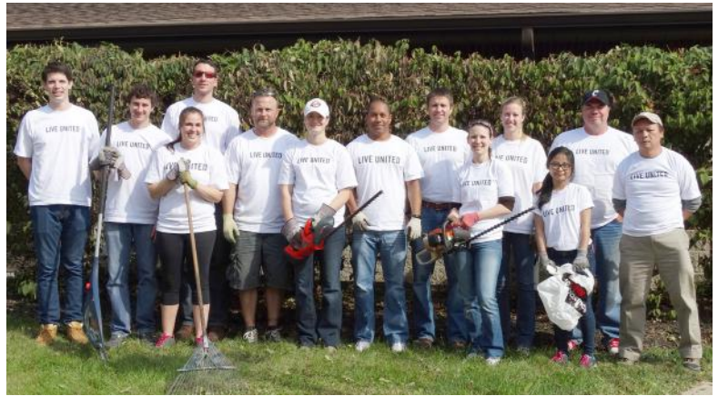
VOLUNTEERS FROM ETHICON ENDO-SURGERY, INC.