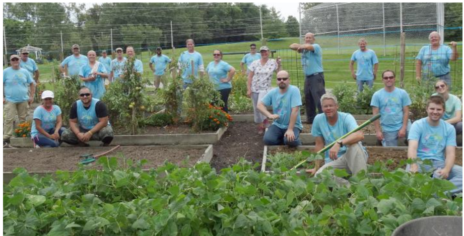
VOLUNTEERS FROM L'OREAL MANUFACTURING FACILITY

AT&T Pioneers Campbell County Schools - Central Office Fund Evaluation Group Katz, Teller, Brant & Hild L'Oreal Manufacturing Facility NKU Students Omnicare, Inc. Perfetti Van Melle Seven Hills St. Elizabeth St. Elizabeth Heart & Vascular Transfreight