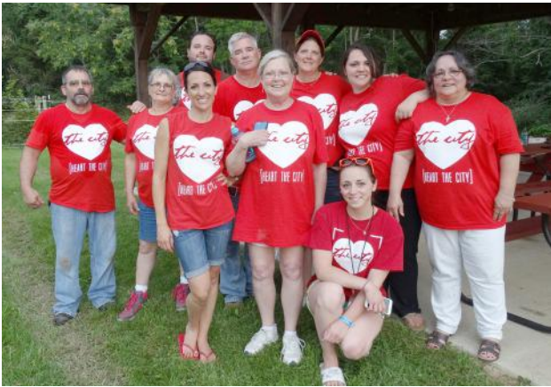
VOLUNTEERS FROM 7 HILLS CHURCH